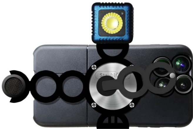
Shown in use

(Note: Concept mockup, not final design)