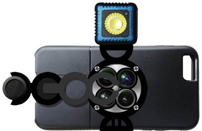
Shown stored away when not in use

(can be moved freely around on the plate, to place the selected lens onto any mobile phone camera position)